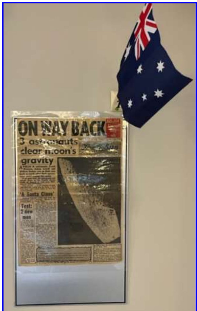
The start of the display