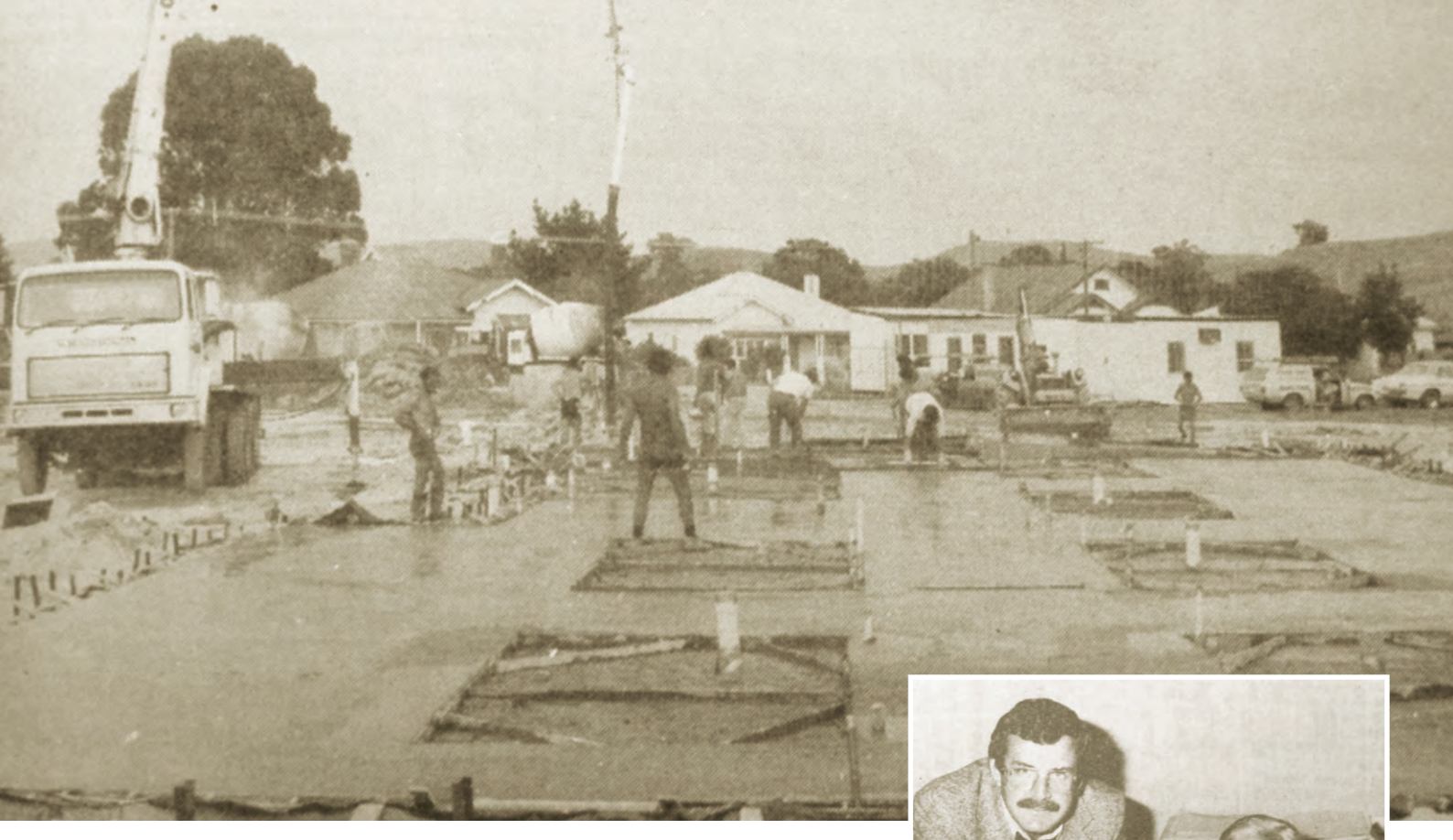
Concrete slabs being poured on the Kellock site in December 1983.

project. The Diocese, as the landowner and therefore owner of Kellock Lodge, is the nominated Provider to the Department of Social Services, but was never intended or required to provide any financial support. The financial backing initially came from the Shire and community and, since the opening of the building, from the community and the Alexandra Opportunity Shop.