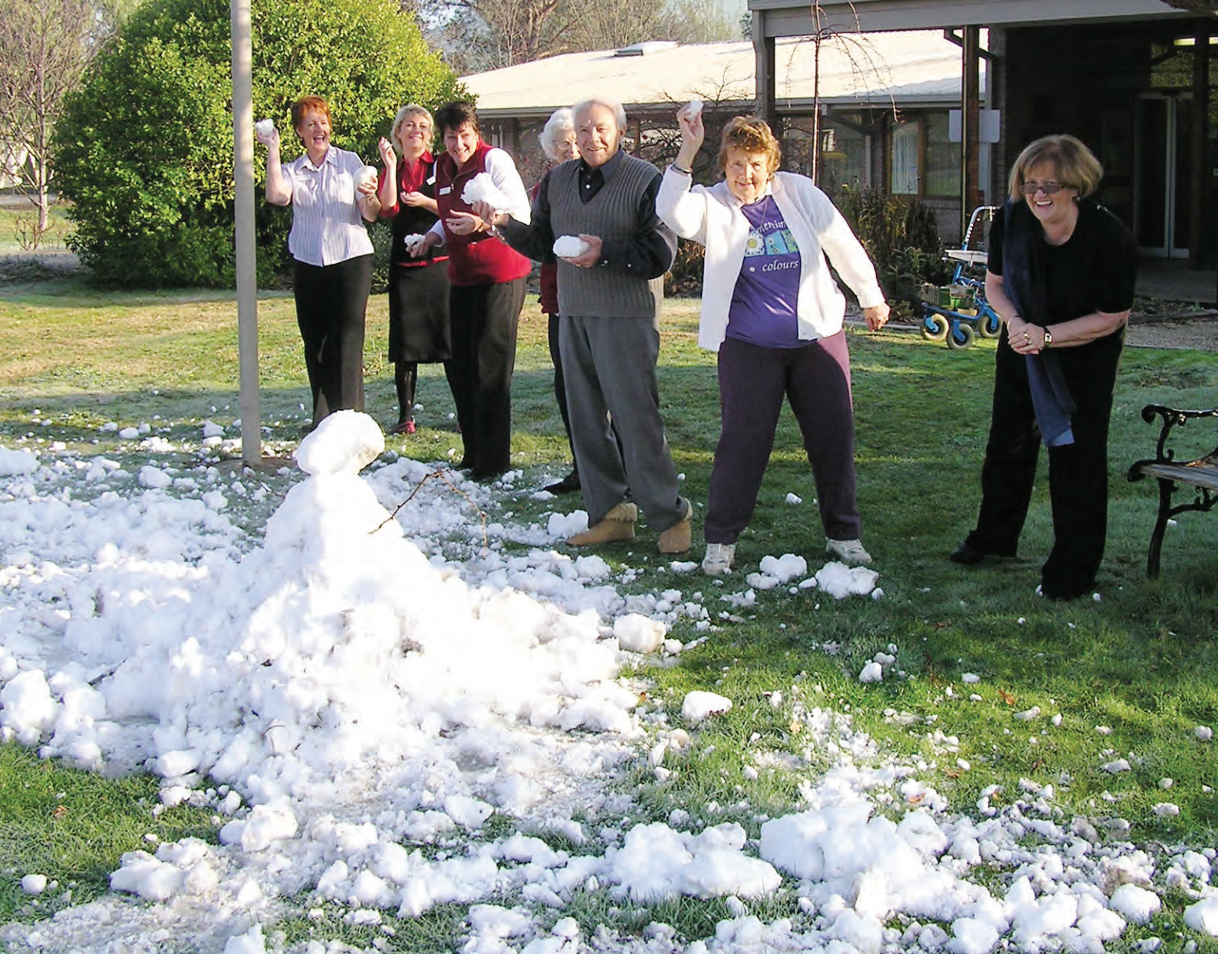
In July 2007, as heavy snow fell in the district, a load from Rubicon was dumped in the Kellock grounds, much to the residents' delight.